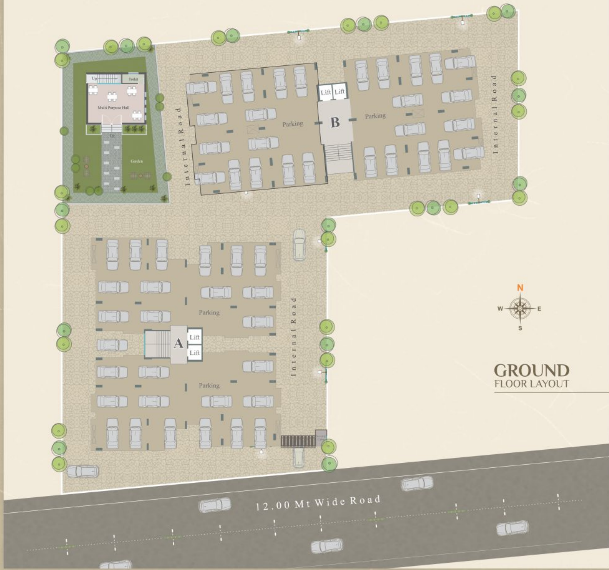
GROUND FLOOR LAYOUT