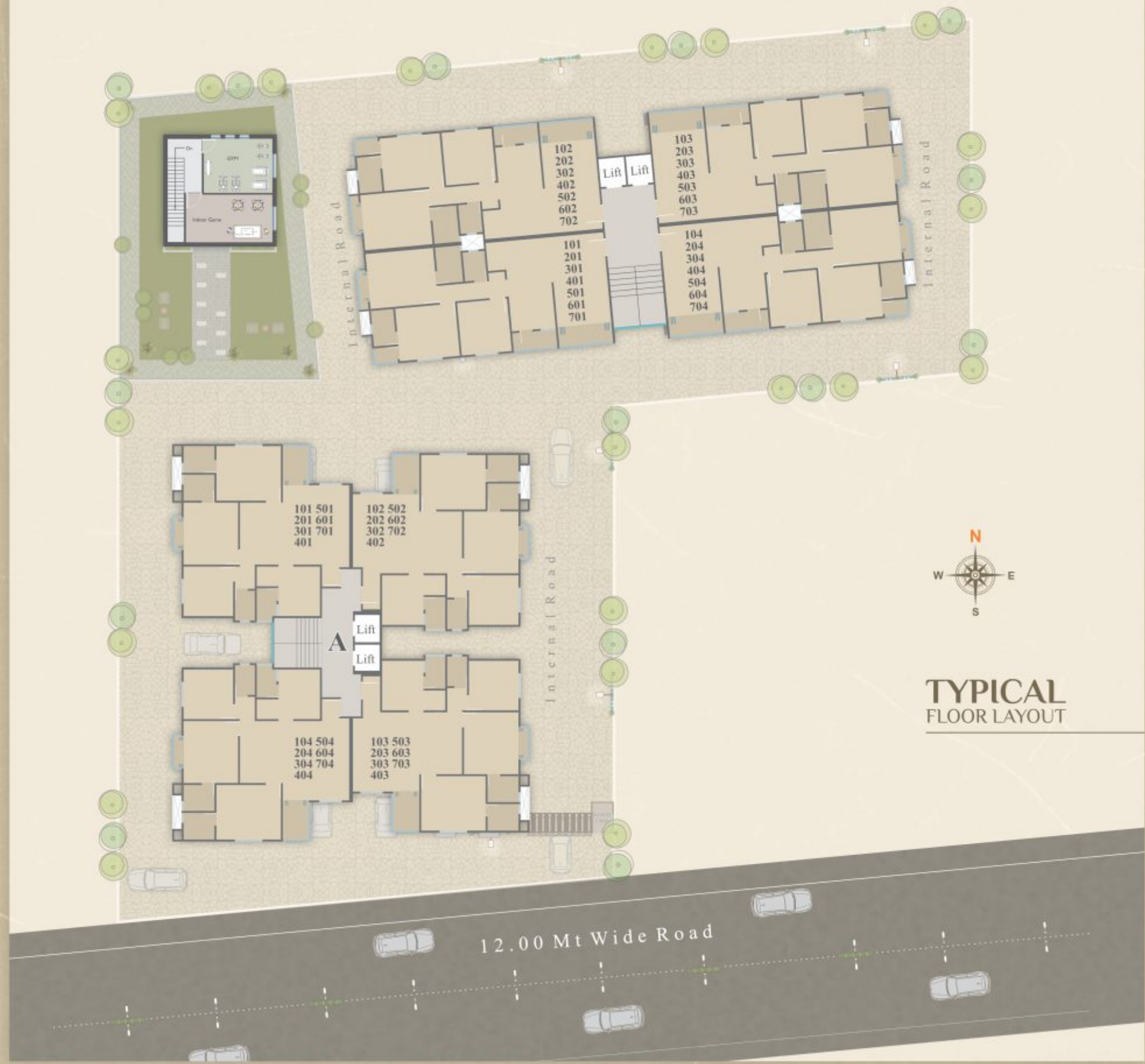
TYPICAL FLOOR LAYOUT